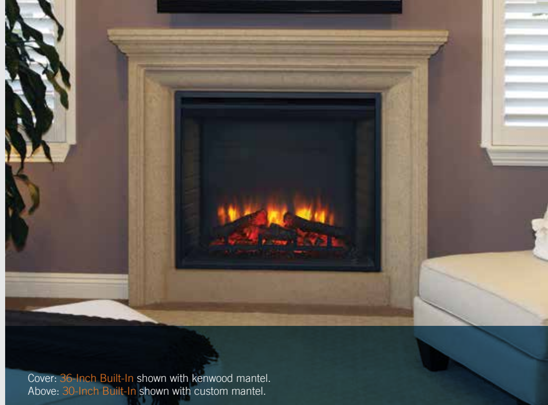
Cover: 36-Inch Built-In shown with kenwood mantel. Above: 30-Inch Built-In shown with custom mantel.